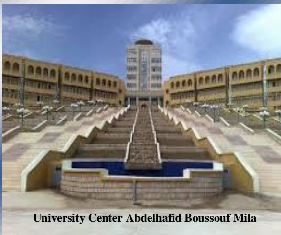
University Center Abdelhafid Boussouf Mila

University Center A. Boussouf of Mila, Algeria